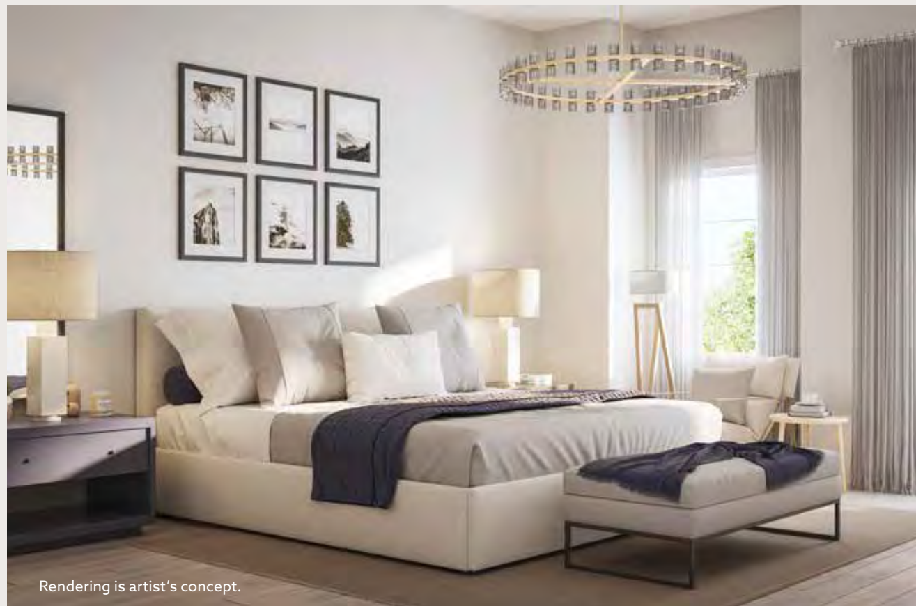
Rendering is artist's concept.

DesignStudio+ is Camcos' immersive design studio experience. With an array of personalized interior design choices, our team of in-house experts provides the guidance you need to help you create a home that is entirely your own.