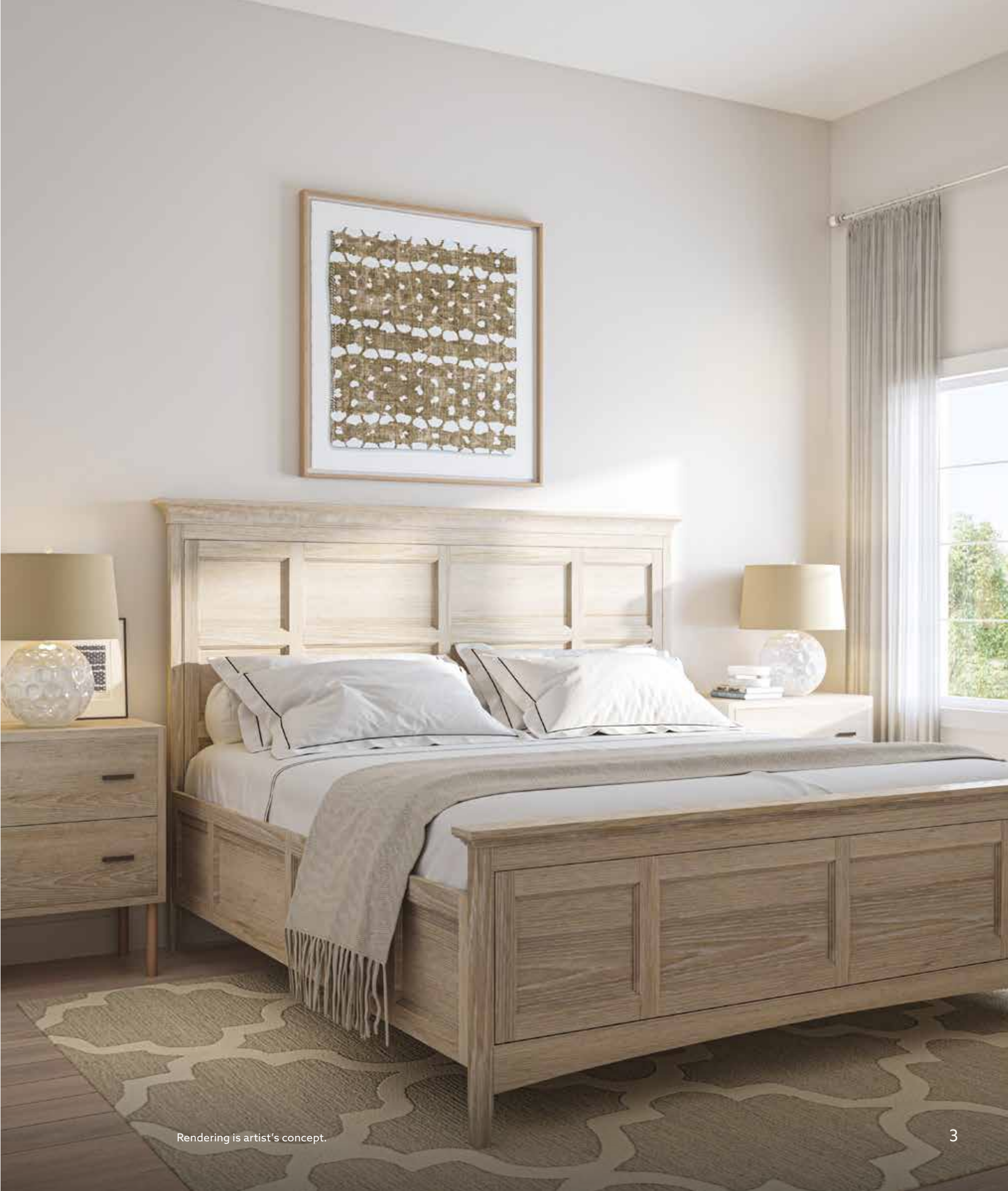
Rendering is artist's concept.

Introducing Canterbury Lanes, an exclusive collection of luxury townhomes coming to King City. Nestled steps away from the quaint town centre at the intersection of Keele Street and King Road, each of the 48 townhomes is a testament to classic design aesthetics. Equipped with single or double car garages and expansive layouts of up to 2,500 square feet, Canterbury Lanes is your chance to experience more.