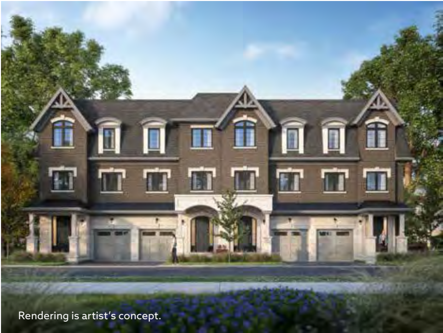
Rendering is artist's concept.

Introducing Canterbury Lanes, an exclusive collection of luxury townhomes coming to King City. Nestled steps away from the quaint town centre at the intersection of Keele Street and King Road, each of the 48 townhomes is a testament to classic design aesthetics. Equipped with single or double car garages and expansive layouts of up to 2,500 square feet, Canterbury Lanes is your chance to experience more.